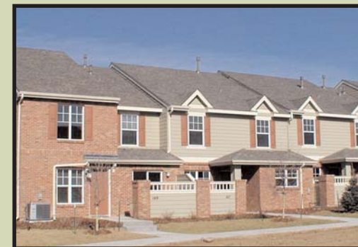
Maple Park Townhomes

◆PowerHouse Plaza Office Condominiums, the Richards Building and the Iris Building opened.