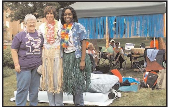
A top fund-raising team, Pinnacol Assurance employees set up a tropical-themed camp at last year's Relay For Life.